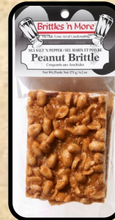
Sea Salt & Pepper Peanut