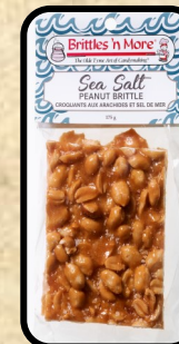
Sea Salt Peanut